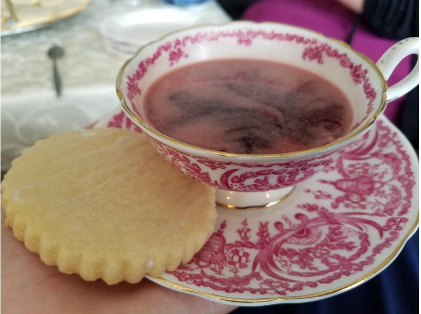
Alanna Coblentz, OH, age: 16

Alanna sent in a few other amazing pictures that will be featured in the next couple of magazines. Keep your eyes open!